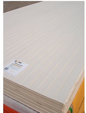
1.6" V-Bead pattern on the reverse side, primed and ready to use